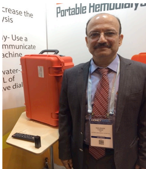
Figure 6: Dharma hemodialysis machine. Its size is equal to a small suitcase weighing 18 lbs only. One can easily imagine its actual size in the picture.

continuously prepares and reuses the spent dialysate to regenerate the dialysate online, thus no need of continuous water supply as in Tablo hemodialysis machine but similar to NxStage hemodialysis machine. Figure 7 reveals the inner assembly and have made a diagrammatic illustration for understanding.