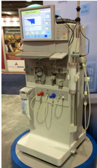
Figure 2: Fresenius T2008 machine with its LCD display and built in Critline monitor for biofeedback.

Thus in a patient reaching a particular hematocrit may indicate a drop in blood pressure due to extra fluid removal and the machine automatically decreases or stops the ultrafiltration. Once due to refilling of the intravascular volume the hematocrit again drops leading to a feedback for initiation of ultrafiltration. Gambro and Nipro machines are almost same in terms of features and Kt/V measured by Na conductance.