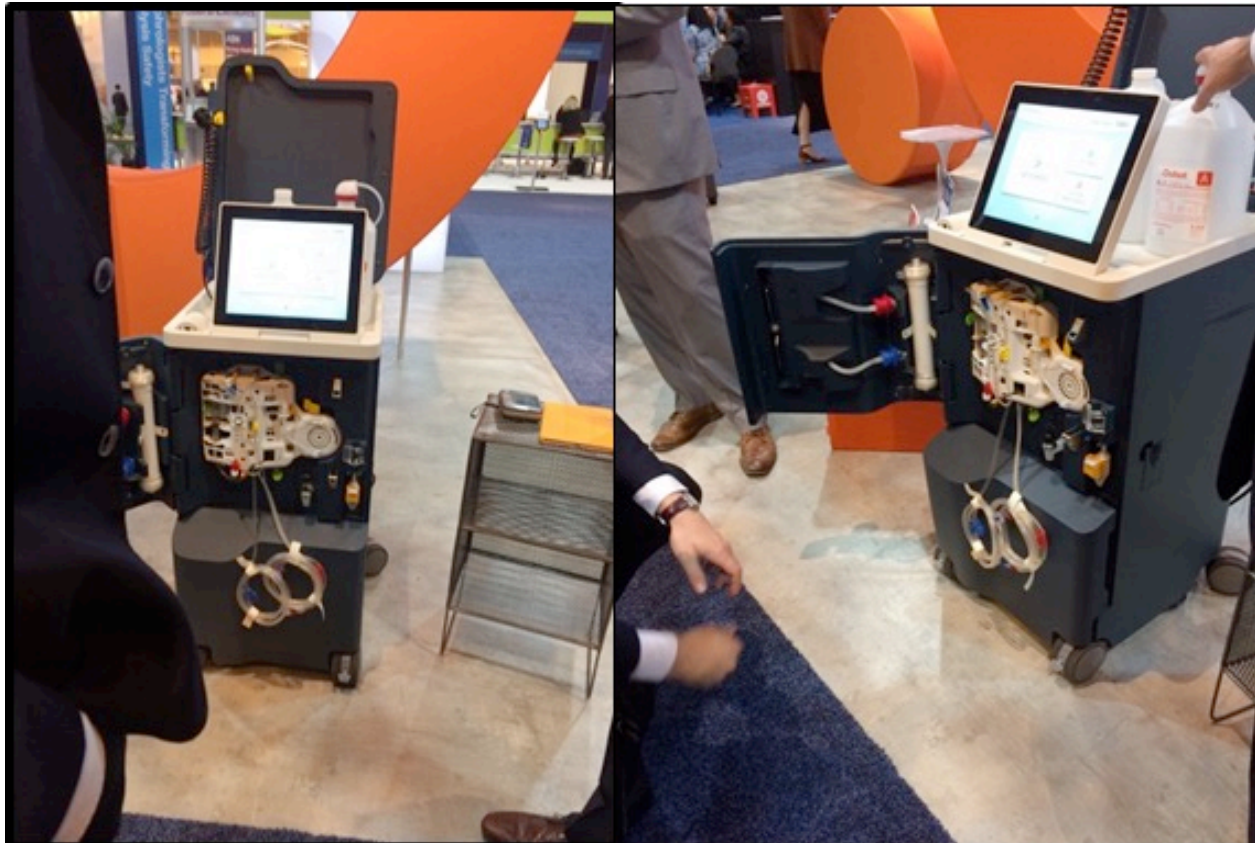
Figure 5: Tablo Hemodialysis machine. Cassette with tubing is shown.

As mentioned on their website: "Tablo is an all-in-one dialysis solution: it makes clean water, produces dialysate, takes blood pressure and delivers medication... all in a compact table-height package. No additional equipment to connect. No heavy bags of fluid to hang. There's not even a hospital pole. Goodbye accessories, hello simplicity."