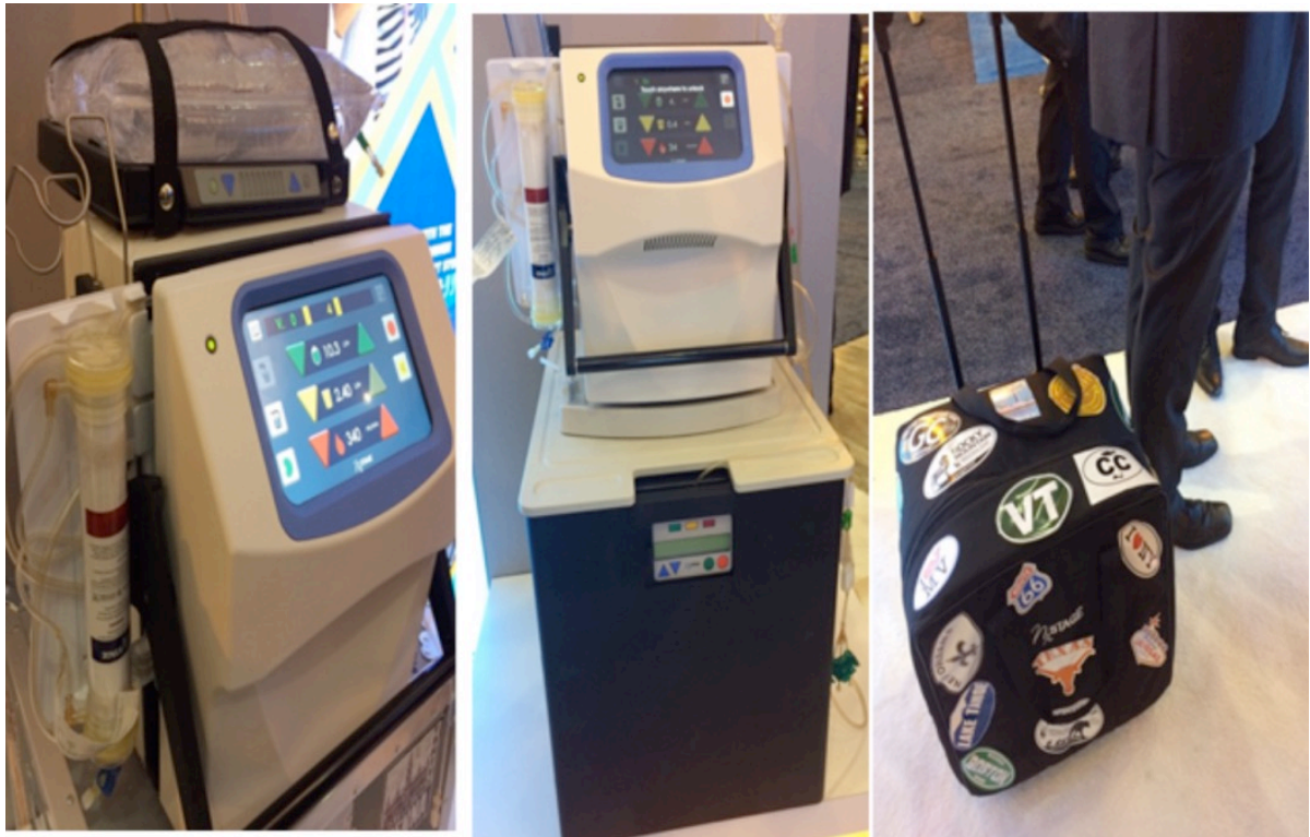
Figure 4: NxStage One can use pre made dialysate bags 5 L each or using the 5 L Tap water to make your own Dialysate. That is made online. It is compact and a carry along bag easily fits it for mobility.

NxStage was the first in market providing a small bedside table size machine that generates water from the tap water and no separate reverse osmosis plant is need for water supply. The dialysate chemicals are provided as liquid or powder form to add to the water. The large amount of dialysate is made online.